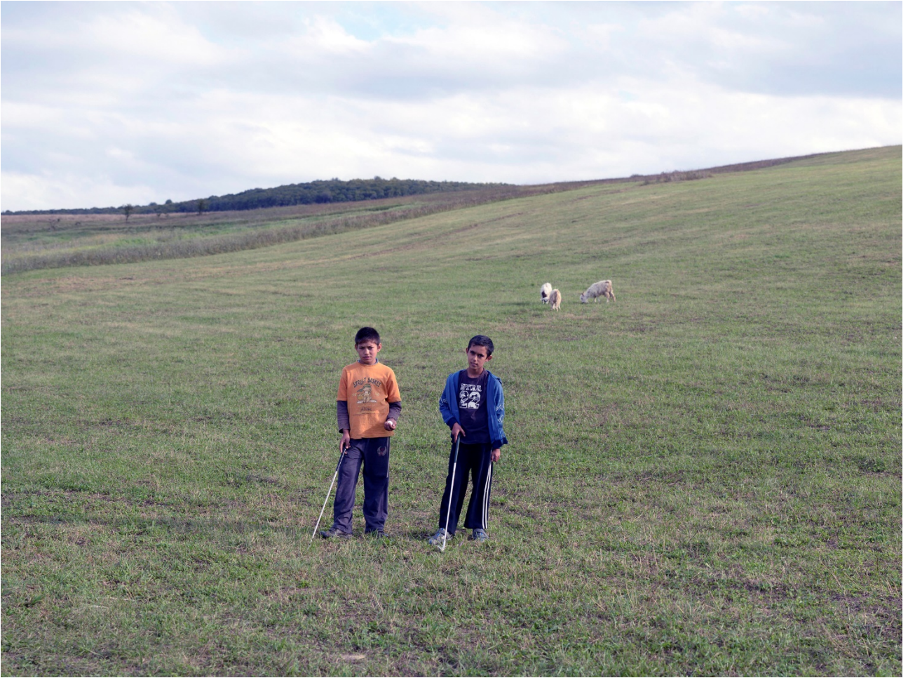
Children playing golf, Iceland (Ikland), 2013