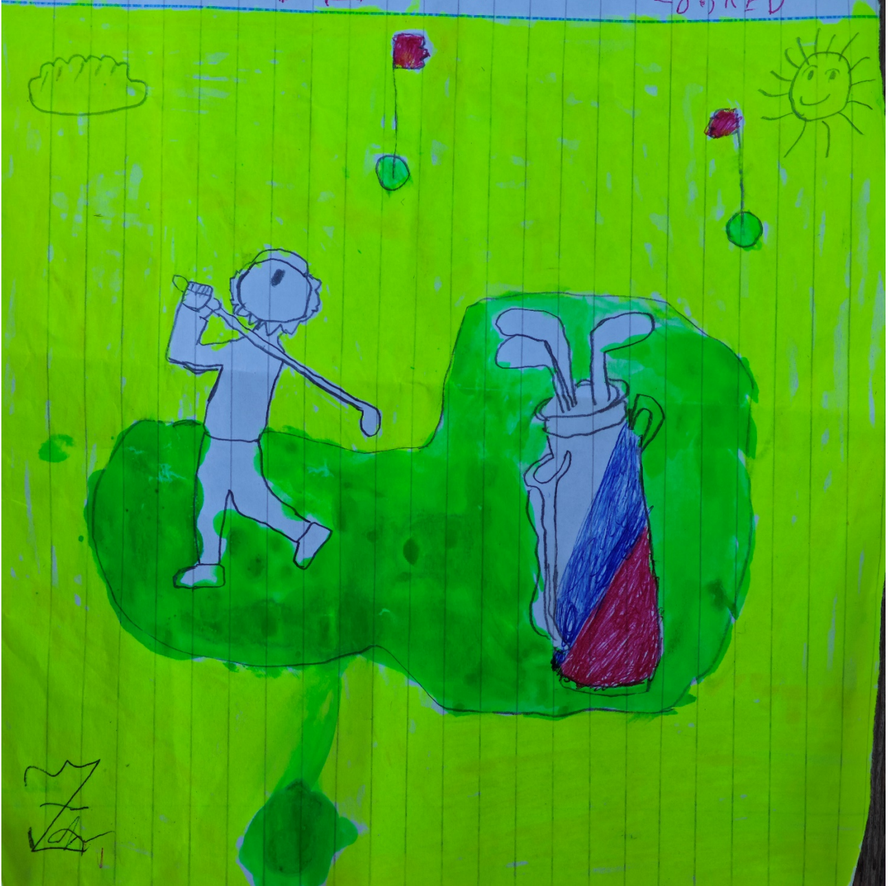
Children's drawing, 2025