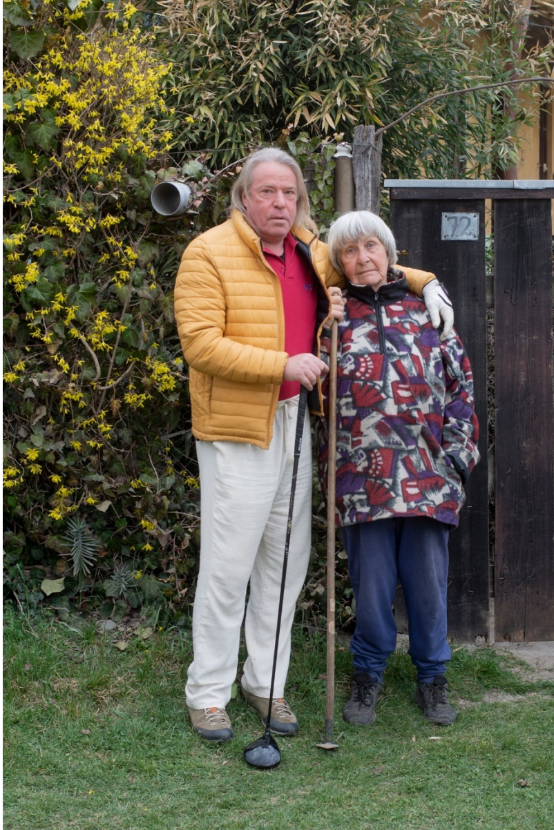
With my mother, Iceland (Ikland), March 2026