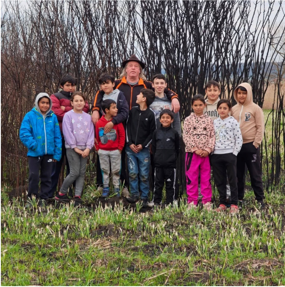
With my students, Dumbrăvioara (Sáromberke), 2024