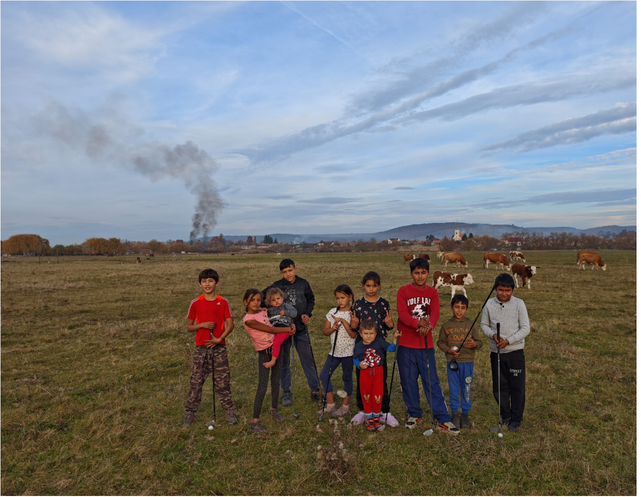
On the 'golf course' in Dumbrăvioara (Sáromberke), 2024