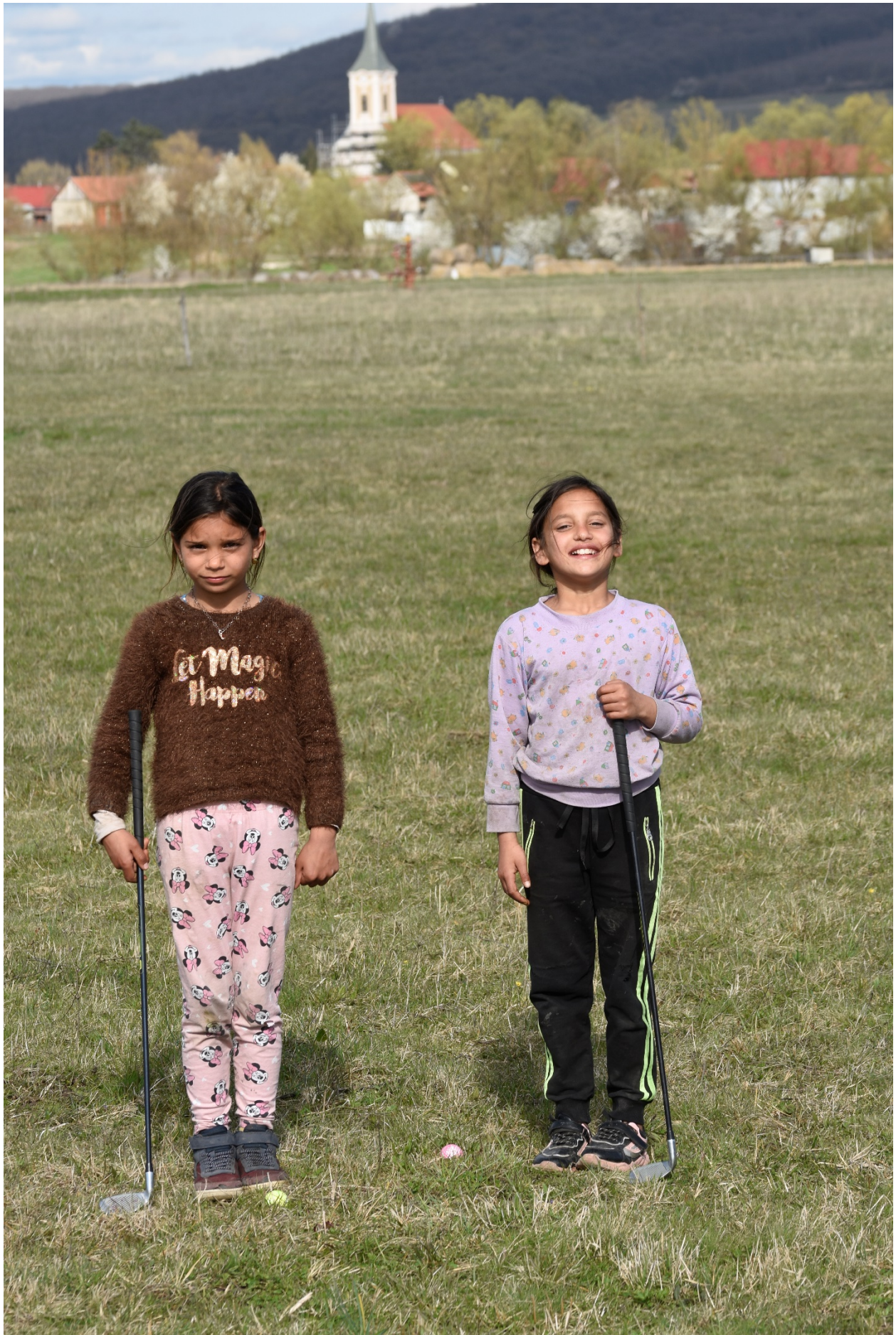
On the 'golf course' in Dumbrăvioara (Sáromberke), 2024