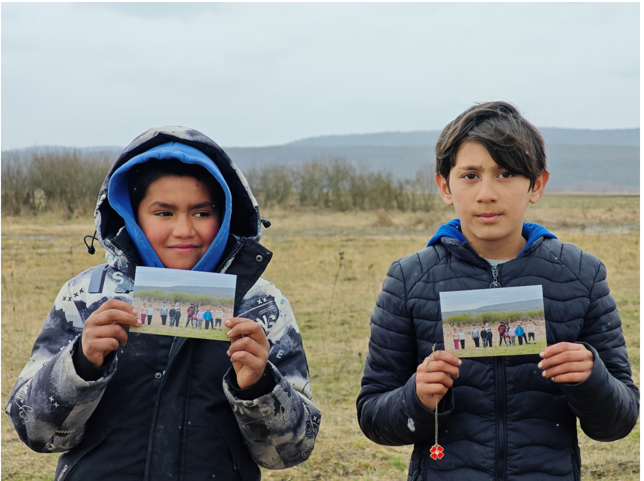
On the 'golf course' in Dumbrăvioara (Sáromberke), 2025