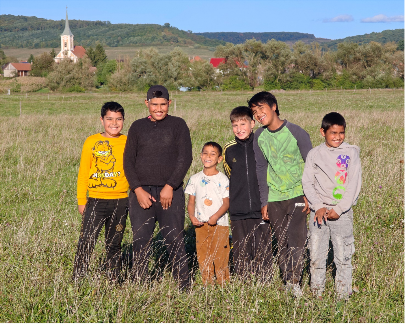
On the 'golf course' in Dumbrăvioara (Sáromberke), 2025