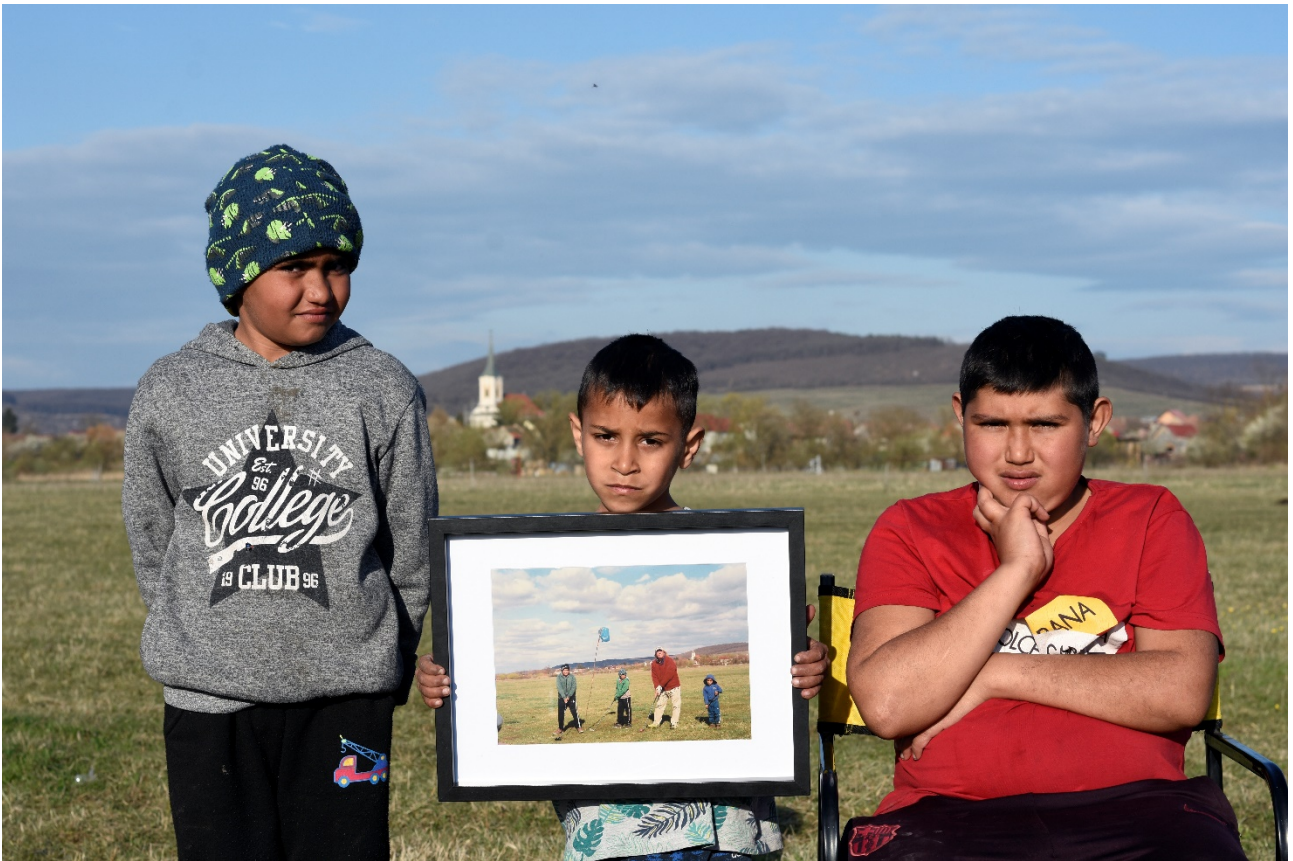
On the 'golf course' in Dumbrăvioara (Sáromberke), 2024