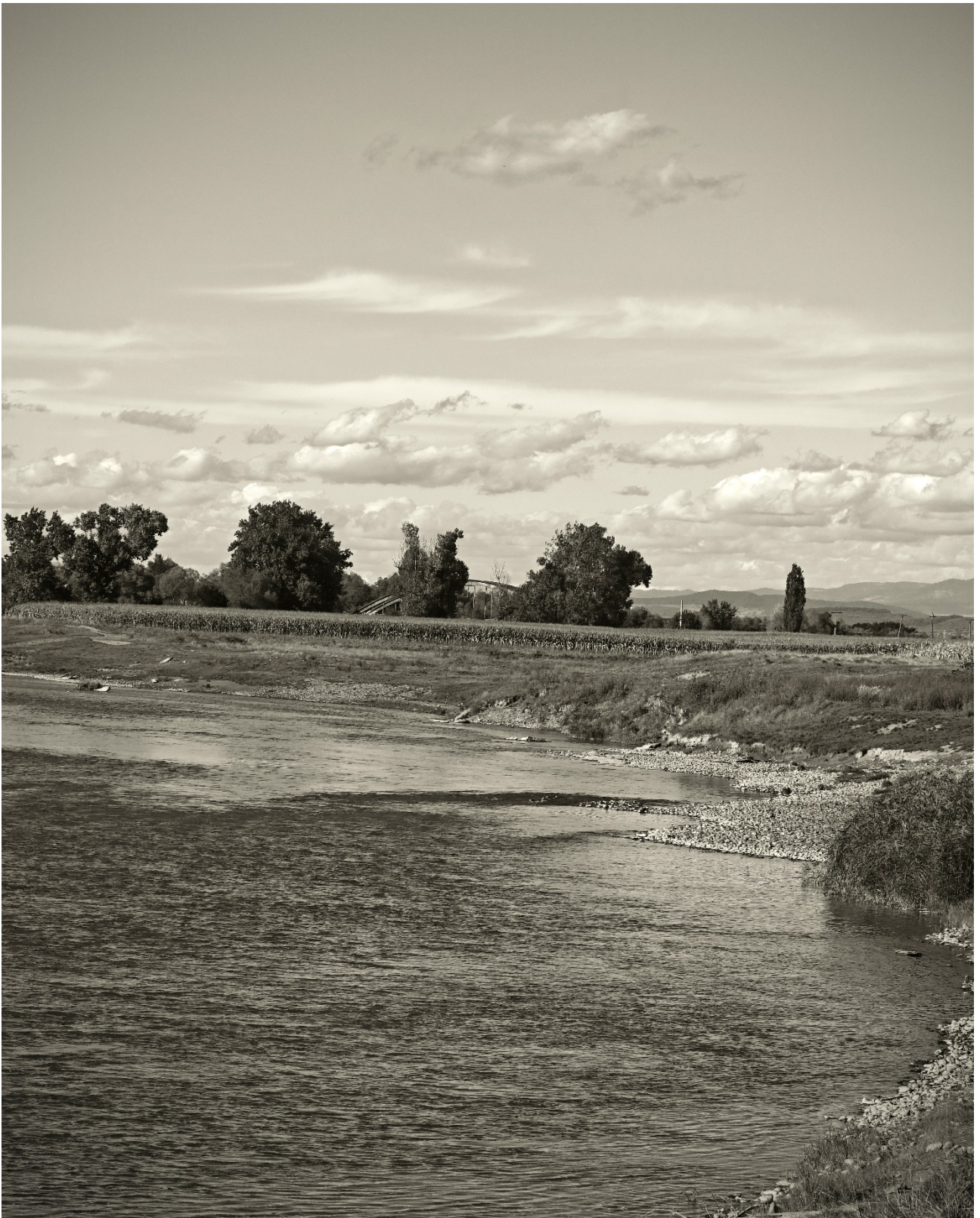
Mureş riverbank, 2025