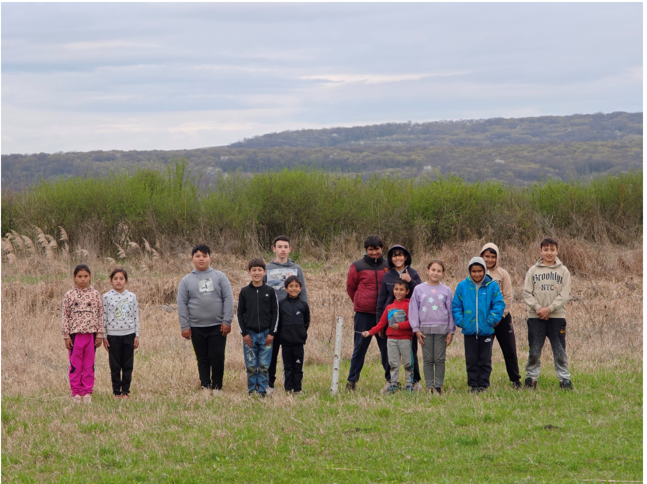
On the 'golf course' in Dumbrăvioara (Sáromberke), 2025