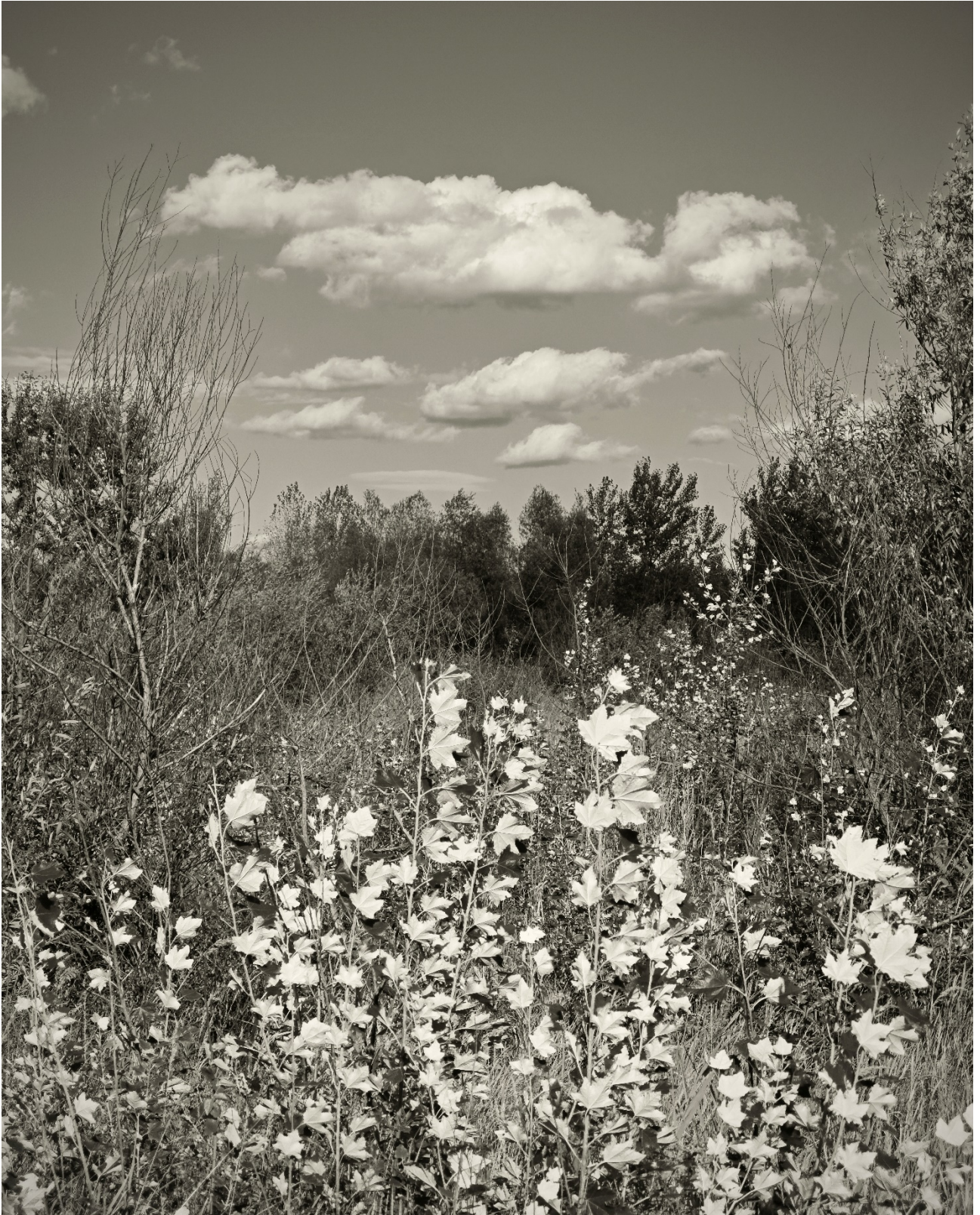
Mureş riverbank, 2025