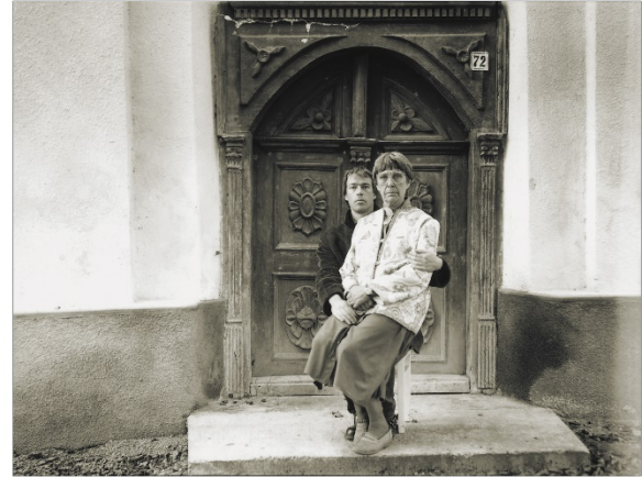
My mother in my grandmother's lap, my mother in my lap, Iceland (Iceland), 1938-1999

Currently, I practice "guerrilla golf" on the pasture of Dumbrăvioara (Sáromberke), but my intention is to establish an official club under the name Iceland Golf Club .