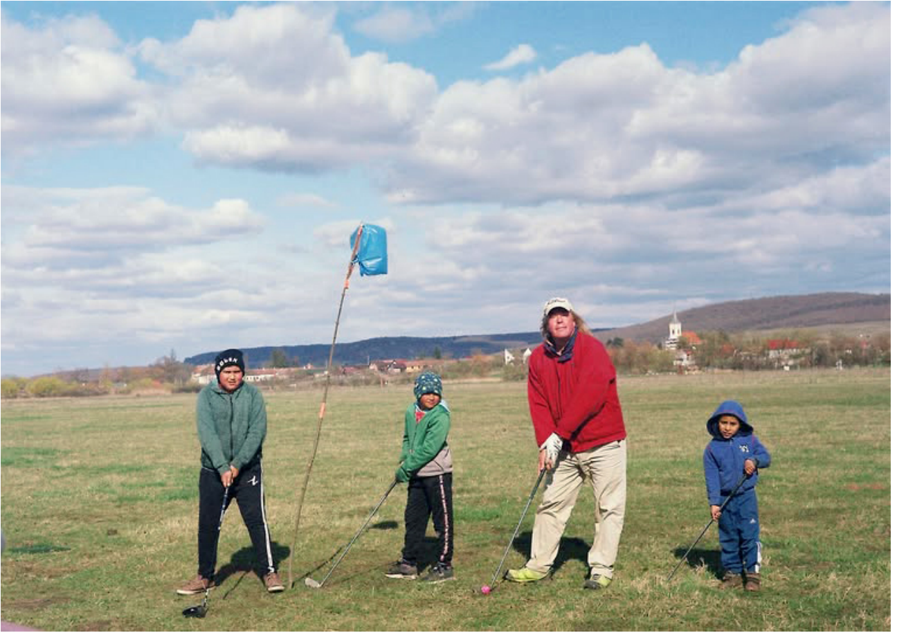
On the 'golf course' in Dumbrăvioara (Sáromberke), 2024