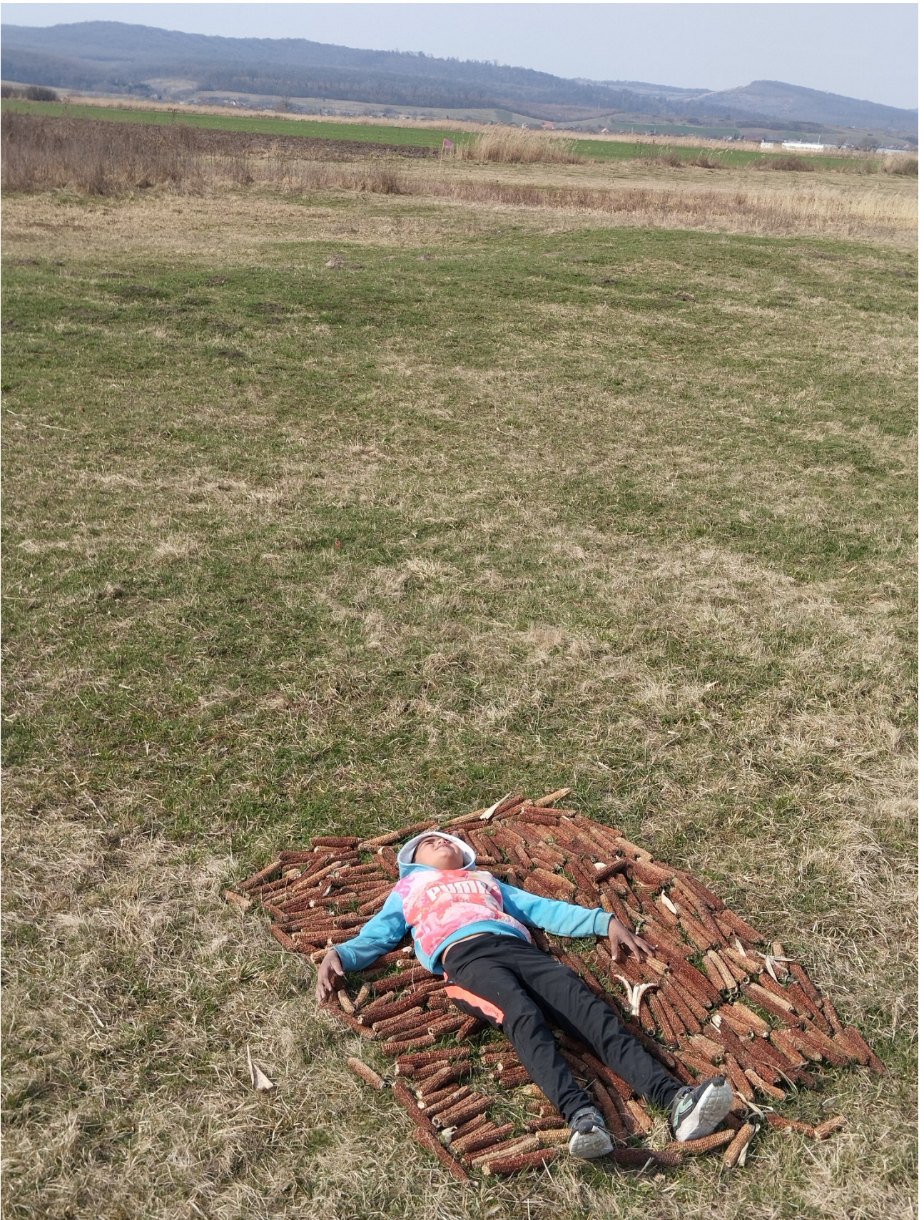
On the 'golf course' in Dumbrăvioara (Sáromberke), 2025